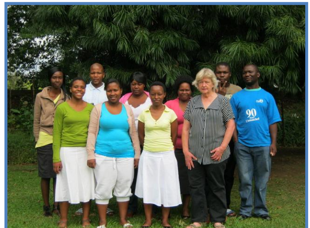
Some of the first semester Nature Conservation students who attended tutorials in Pietermaritzburg