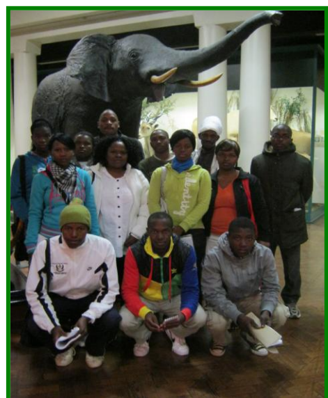
UNISA students visit the museum

We are committed to developing in learners of every age a sense of wonder, joy, fun, inspiration and creativity. We encourage learning through practical activities in natural and cultural settings.