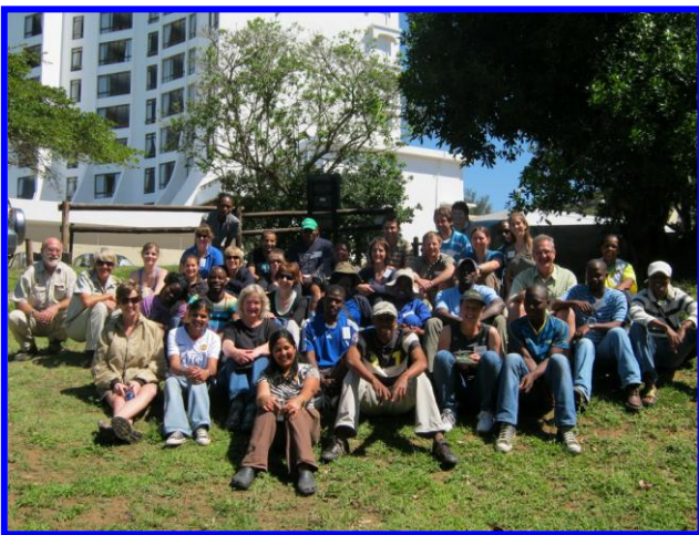
Third year students after a forest ecosystem study at Umhlanga Rocks

A most enjoyable year was spent tutoring the first year students at the Pietermaritzburg campus each Saturday morning in Plant Studies, Animal Studies and Conservation Development.