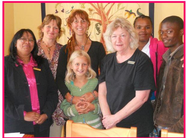
The St. Nich's Eco-Schools project assessment team

The assessment work with the Wildlife and Environment Society of South Africa (WESSA) has continued. This has involved assessment of portfolios of evidence for candidates attending the Environmental Educators Courses run by SustainEd as well as some Eco-Schools portfolios. What wonderful work the Eco-Schools projects does and schools are eager to gain their next certificate, Green Flag and even International Flags. LEARNING THROUGH NATURE has done trips to St Nicholas School, Ixopo and Mtunzini for Eco-Schools.